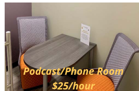
Podcast/Phone Room $25/hour