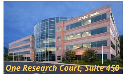
One Research Court, Suite 450