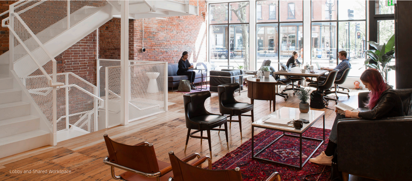
Lobby and Shared Workspace