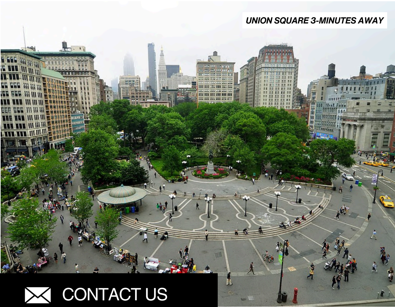
UNION SQUARE 3-MINUTES AWAY