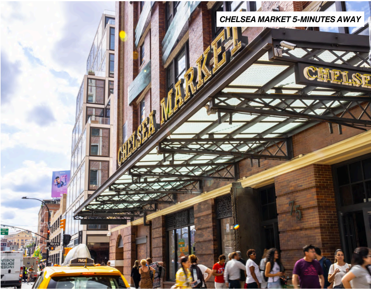
CHELSEA MARKET 5-MINUTES AWAY