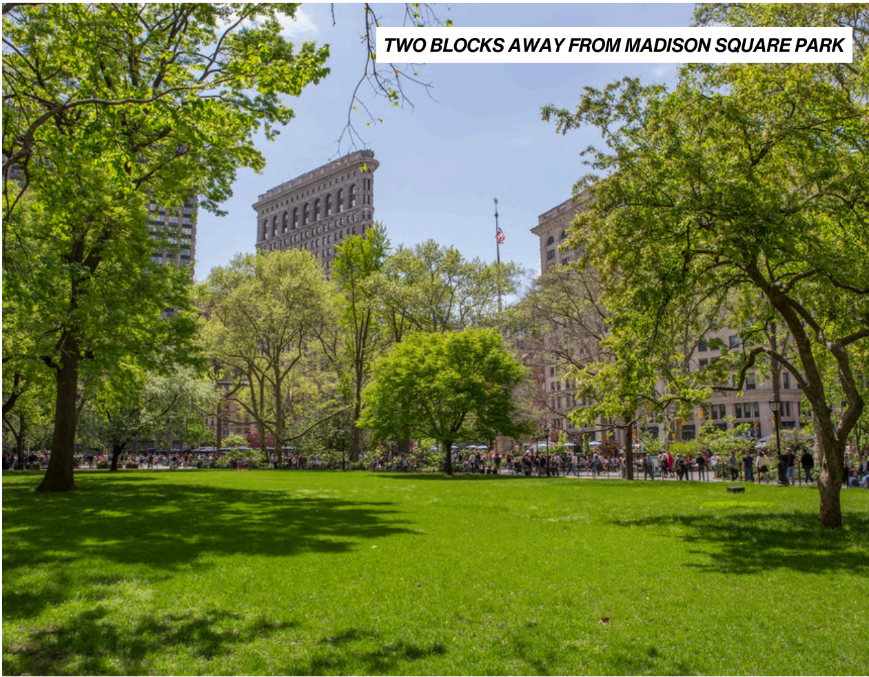
TWO BLOCKS AWAY FROM MADISON SQUARE PARK