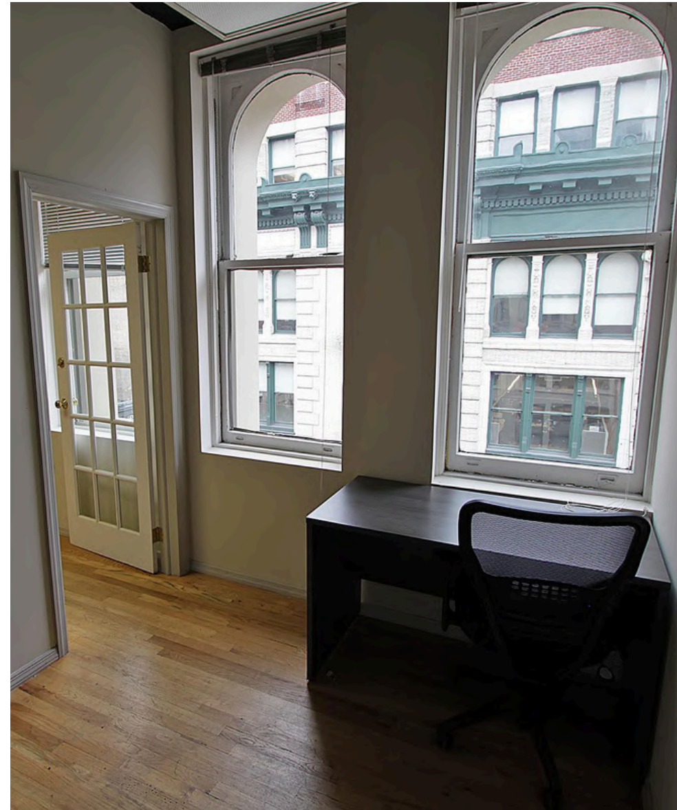
24/7 ACCESS PRIVATE OFFICE SPACE

Our 4-Person, 8-Person, and 12-Person boardrooms are available for booking at any time. All Coalition Space members can book at any location at no additional cost.