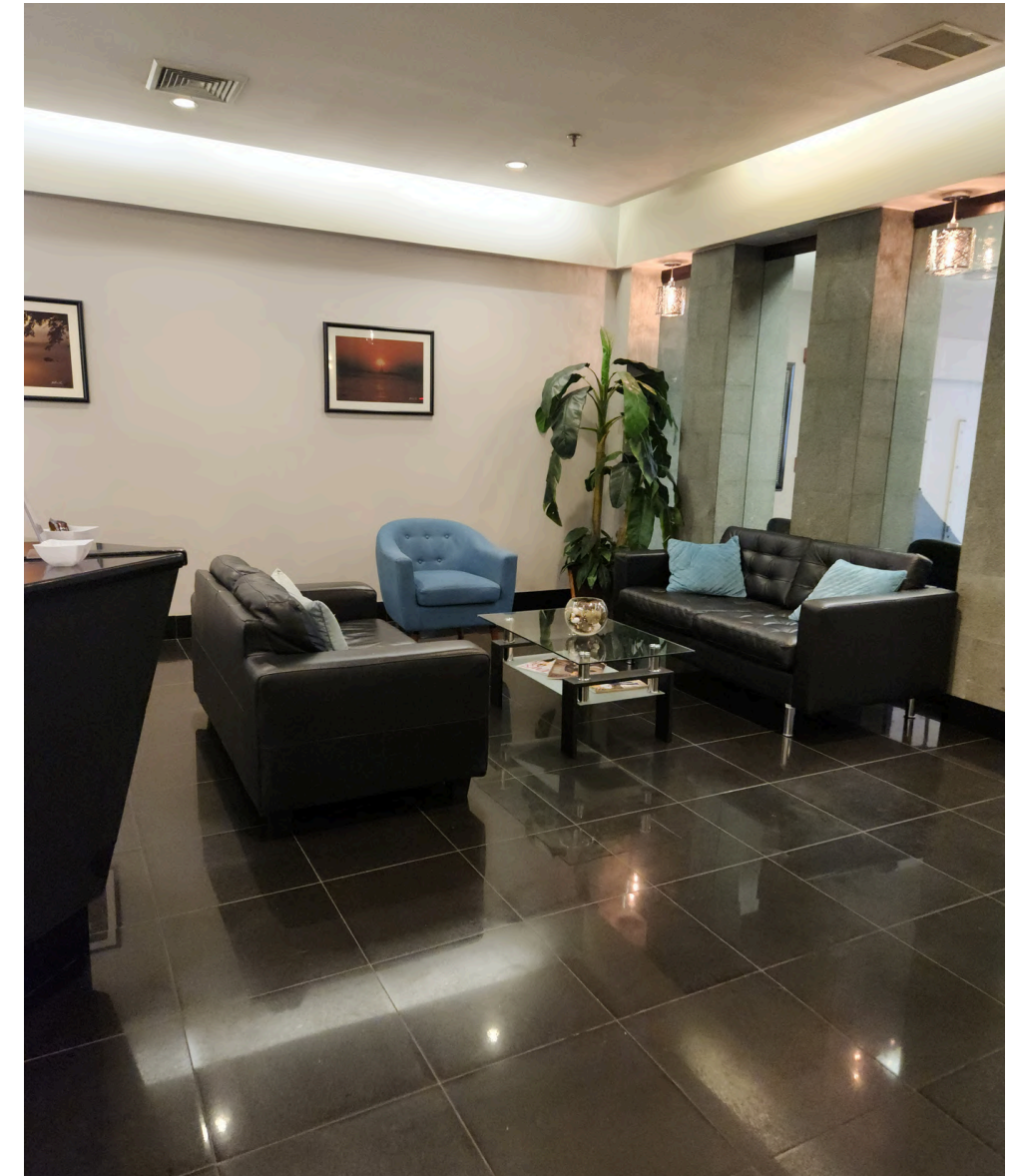
COMMON AREAS + AMENITIES

No set-up fees and fully-furnished office space available for immediate move-in. From hot desks to enterprise spaces, layouts are completely customizable to suit your business's requirements.