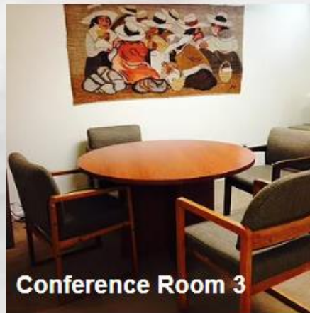
Conference Room 3