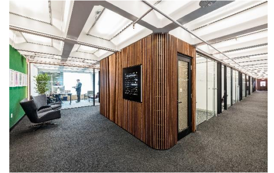
14 th Floor