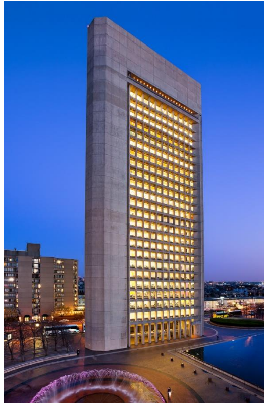
177 Huntington Plaza