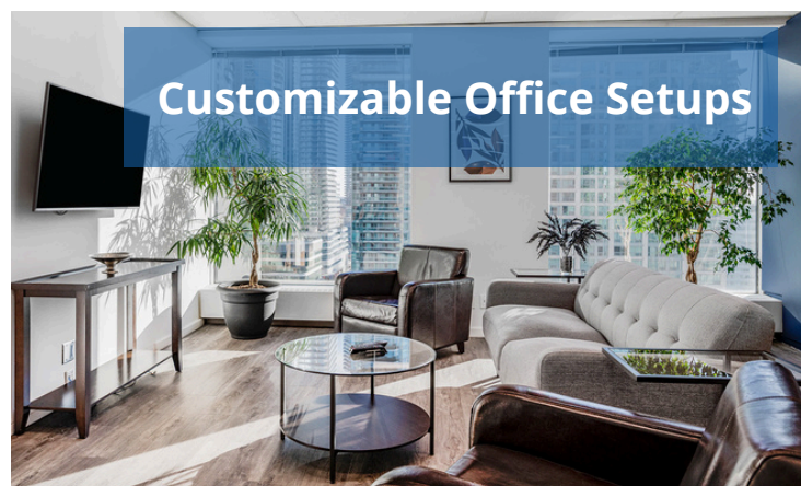
Customizable Office Setups