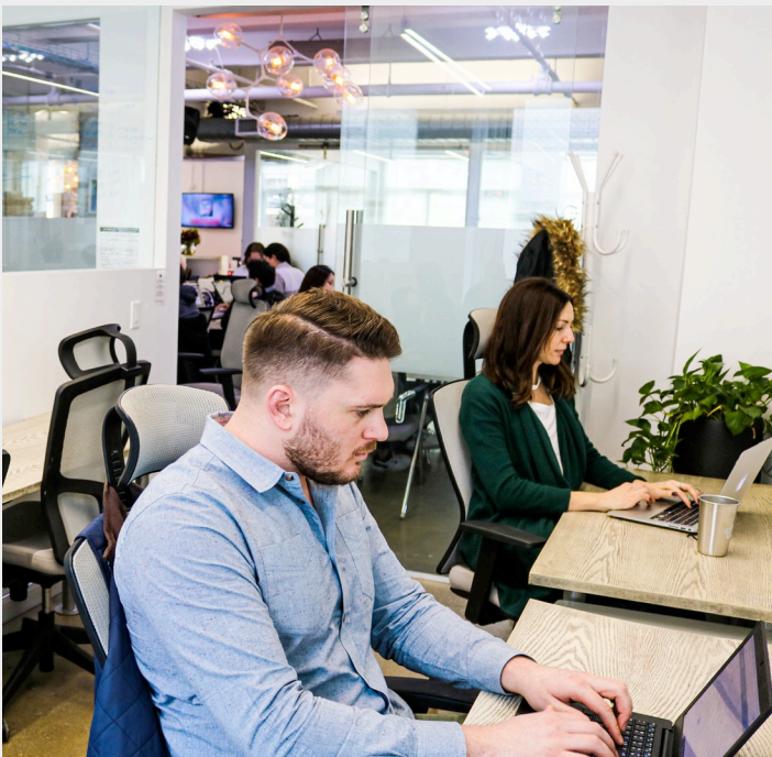
Dedicated Desk, $700/month, 1 person