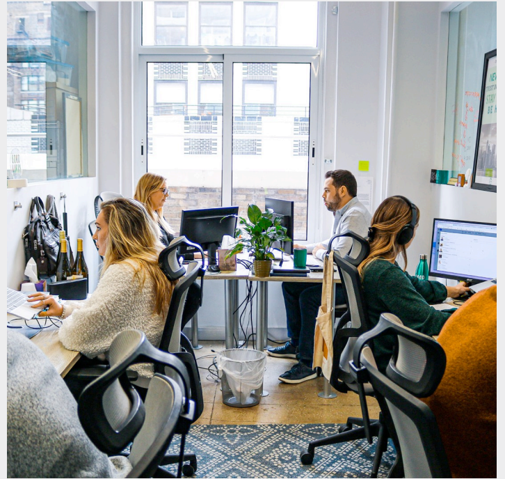
Private Office, $1,500-4,500/month, 2-6 people