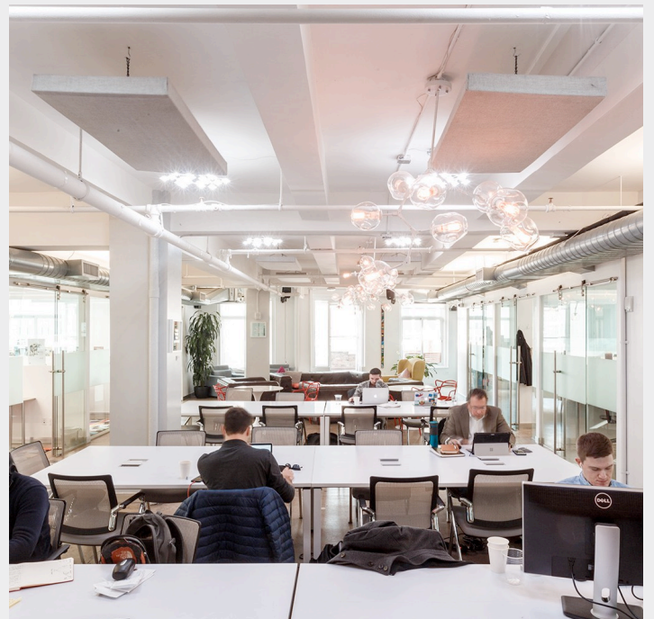
Open Coworking, $500-700/month, 1 person