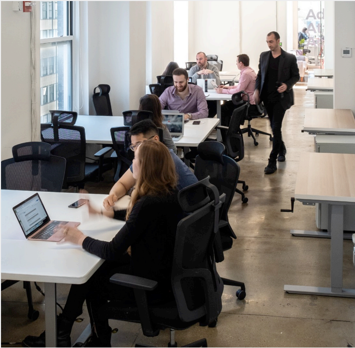
Large Private Office, Starts at $6,000, 6-25 people

Offices are move-in ready with desks, chairs, storage cabinets, wifi and tech support. Layout your office space however you choose. We'll help arrange your office to meet your needs. Brand your office with your company decal and more.